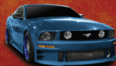
2005-2009 Mustang GT Concept