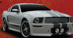
2005-2009 Mustang Eleanor