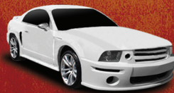
1999-2004 Mustang Gen 5 Conversion