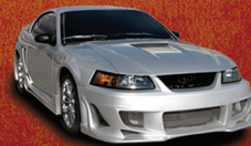
1994-2004 Mustang Bomber