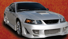
1994-2004 Mustang Bomber