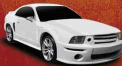
1999-2004 Mustang Gen 5 Conversion