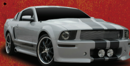
2005-2009 Mustang Eleanor