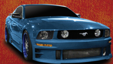
2005-2009 Mustang GT Concept

Watch the new video online and see the amazing durability of our products.