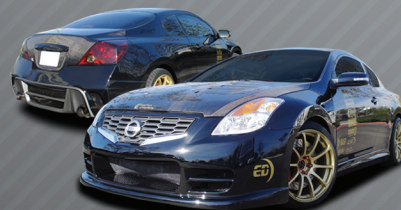
2008-2009 Nissan Altima 2DR GT Concept