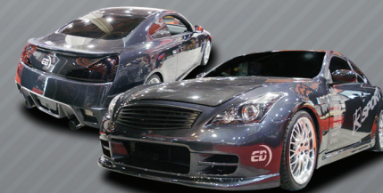
2008-2009 Infiniti G37 2DR GT Concept