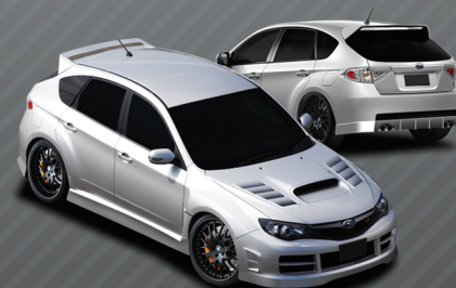
2008-2009 Subaru STI GT Concept