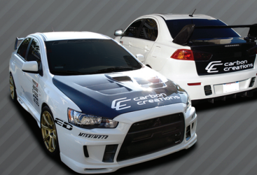
2008-2009 Mitsubishi Evolution X GT Concept